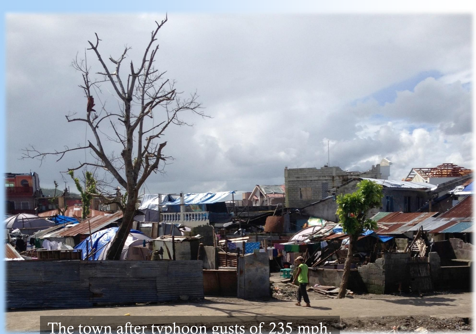
The town after typhoon gusts of 235 mph.