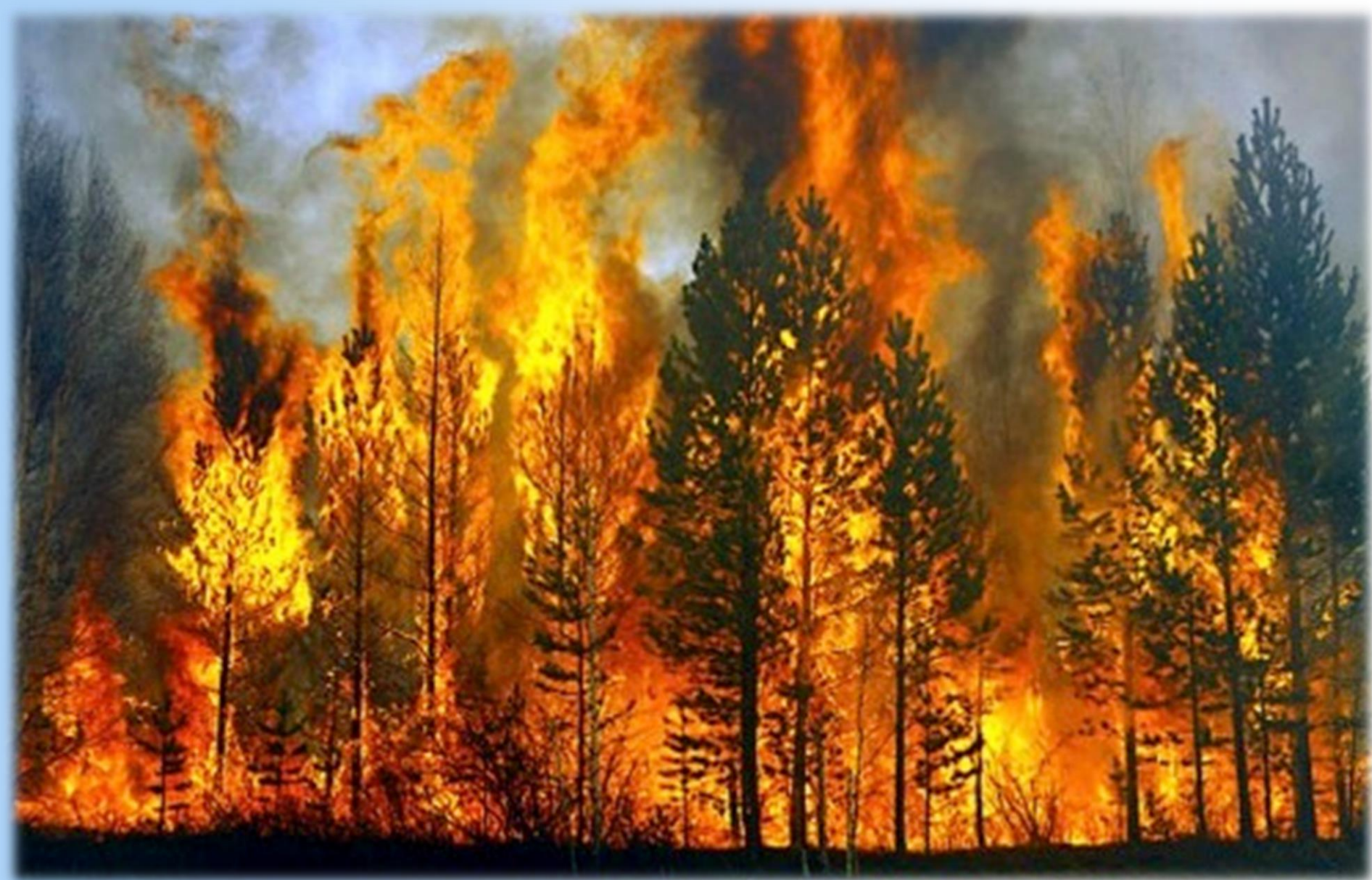
Wall of Fire