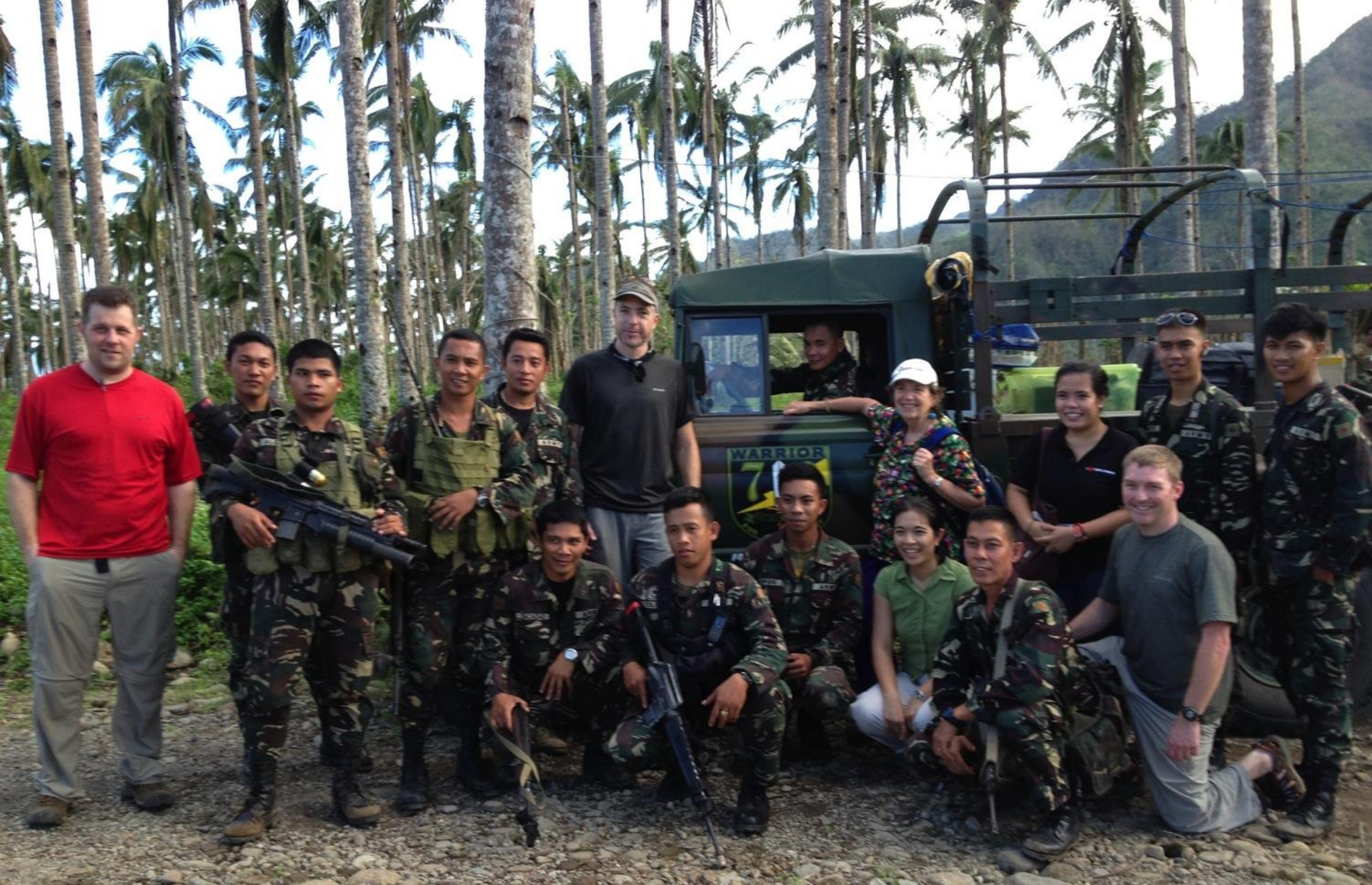
Philippines Army Helps Out