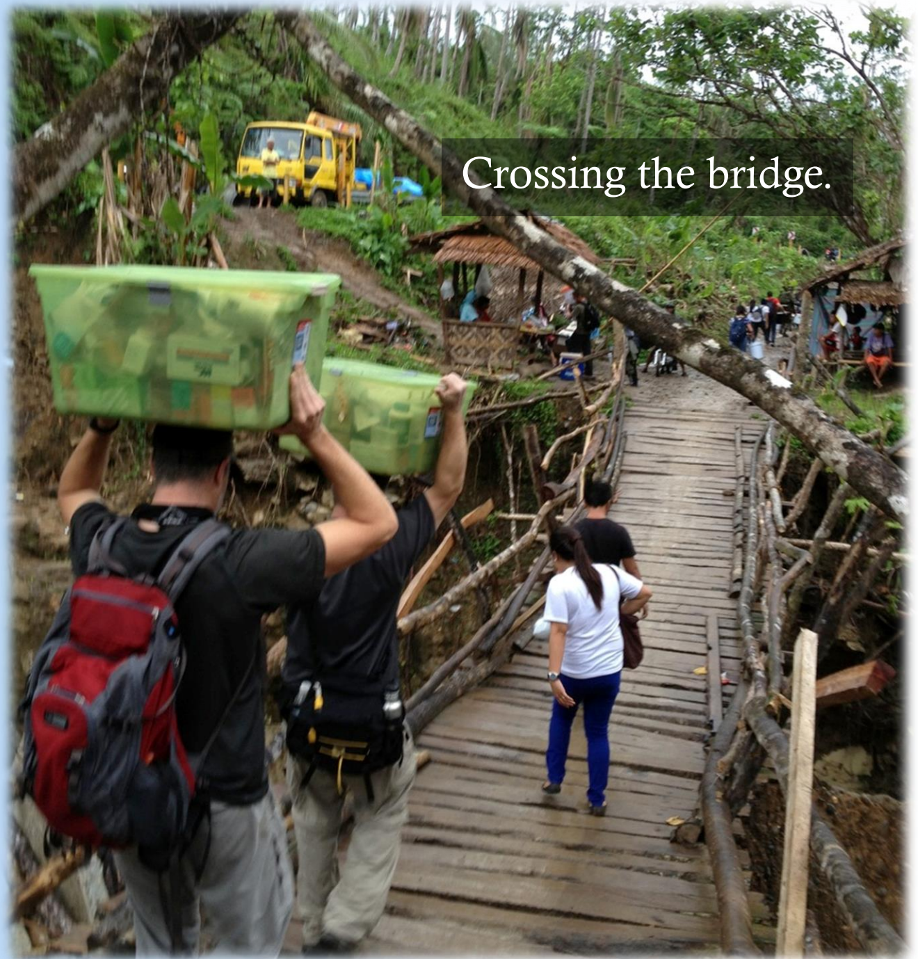
Crossing the bridge.