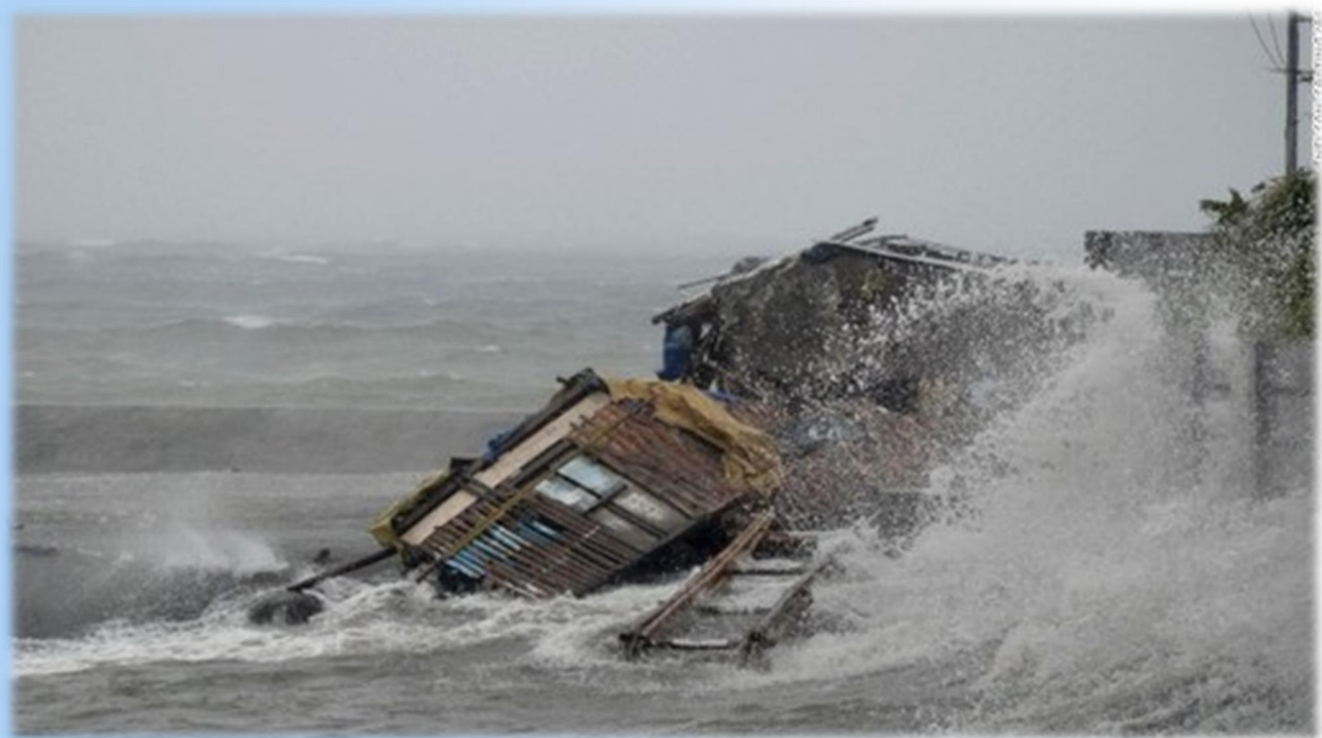
Typhoon Yolanda November 8, 2013