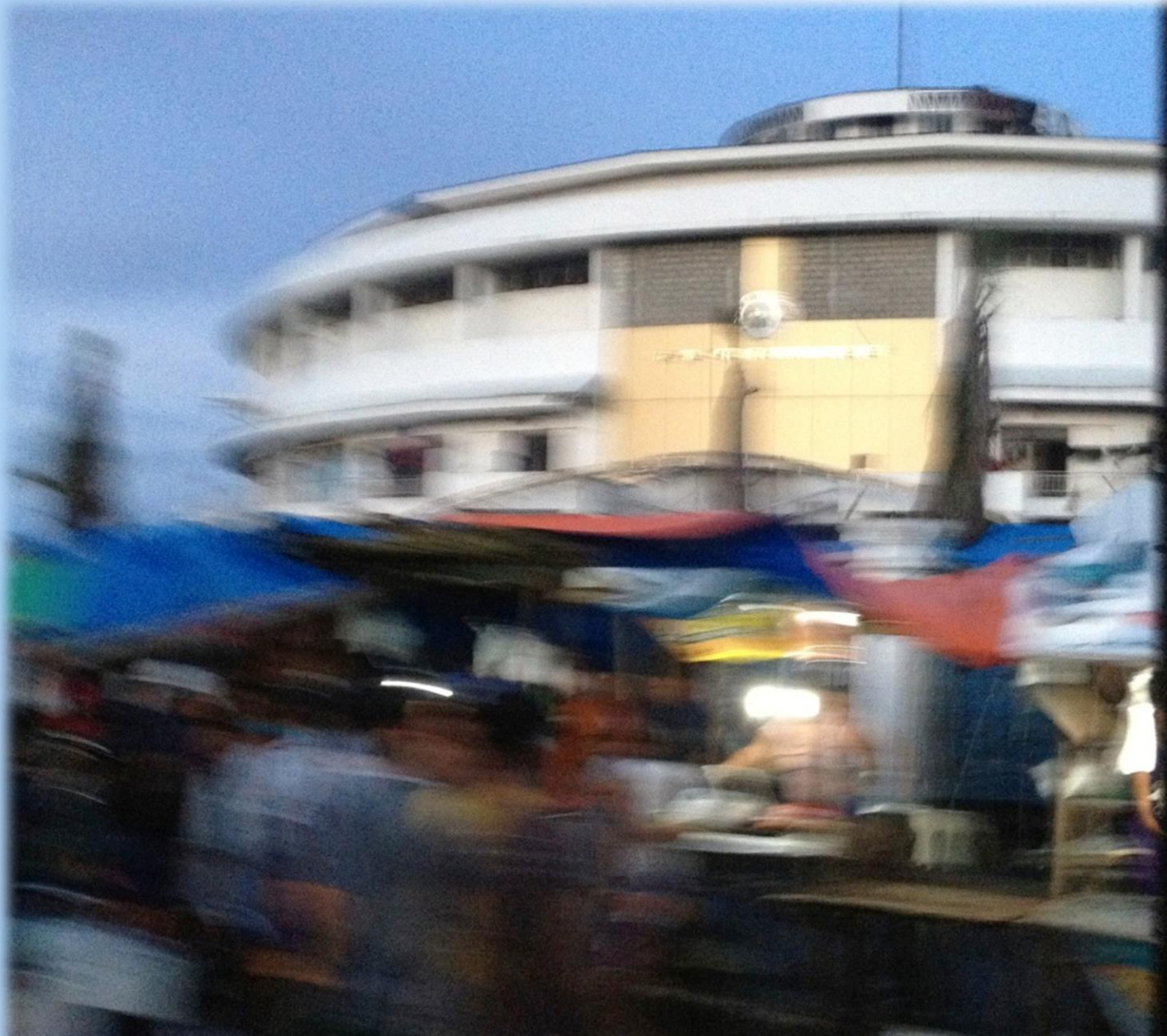
Poor Planning -100 storm surge deaths in the coliseum shelter.